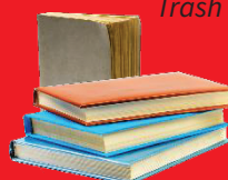
Books Donate or BRC