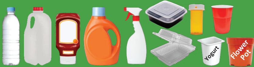
Plastic coded or

Loose in bins, not in plastic bags. Include caps and lids. Please empty and rinse items.