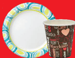
Wax Coated Paper Cups and Plates — Trash