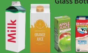
Cartons and Juice Boxes