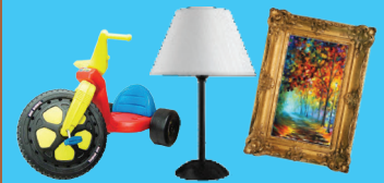
Small Furniture, Household Items, Décor

Open Saturdays 10am–1pm, May–October, in the Bedford Hills Train Station parking lot at the end of Railroad Avenue.