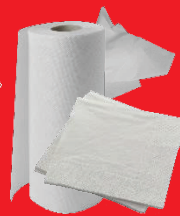
Paper Towels, Napkins, Tissues — Compost Bin or Trash