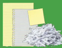
Paper — shredded OK