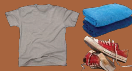
Textiles — clothing, shoes, towels, etc., any condition