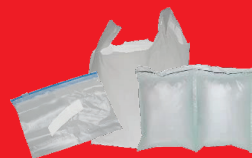
Plastic Bags — store bin or trash bags, carry-out bags, bread bags, produce bags, bubble wrap, dry cleaner bags