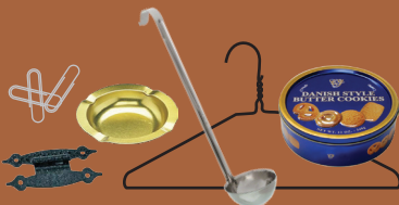
Scrap Metal, any kind and amount

To register for the food scrap drop-off program, Community Compost, and to obtain bins, visit bedford2020.org/ community-compost or email info@bedford2020.org