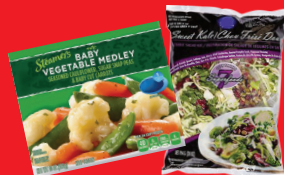
Frozen Food Packaging, Bagged Salad Bags Trash