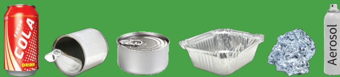
Metal Containers and Foil