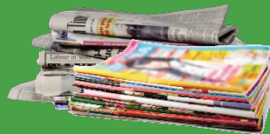
Newspapers, Magazines, Catalogs