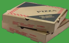
Pizza Boxes — non-greasy parts