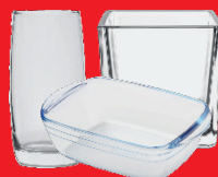
Glass Drinkware, Pyrex, Vases Donate or Trash