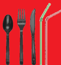
Plastic Utensils and Straws — Trash