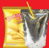
Snack Bags, Food Pouches Trash